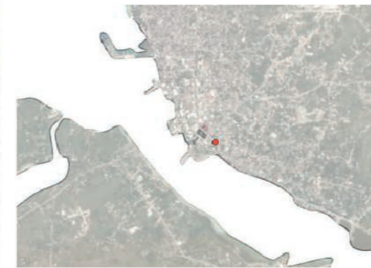
The location of the intervention was chosen based on the surroundings, where numerous heritage buildings are still standing

The reason for the team to tackle heritage conservation and the exposure to the most valuable sites in Tagbilaran was that the heritage houses remaining in the city have been neglected over time, and are not seen as a valuable asset within the community. The development plans for the city of Tagbilaran are alarmingly disconnected from the heritage, history and identity of the context. By raising awareness within the community, our team supported the acknowledgement and conservation of the traditional built environment, as well as the reconnecting of the further city development with the existing environment that celebrates the local identity. Through research, the team was able to identify a solid sense of belonging and pride within the local community. By letting people share their most valuable spots and personal stories within the city, an emotional connection and attachment is created to these places among those who the stories and sites, or Pearls, are shared with. Passion and memory is used as a power tool in order to build a strong sustainable future with great identity.